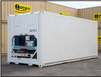
20' unit (painted - optional)