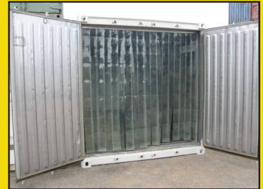
Plastic Strip Curtain