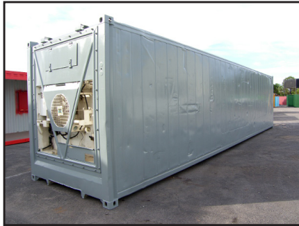
40' unit (painted - optional)