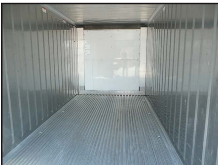
Stainless Steel Interior