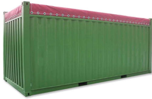
20' Open Top Container