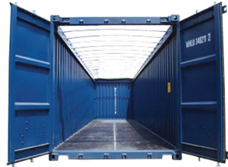
40' Open Top Container